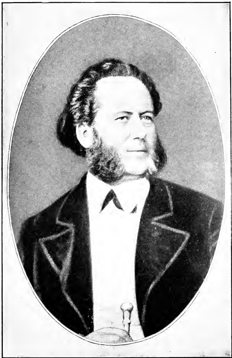
Ibsen in 1868.